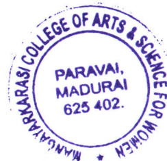
Principal Principal Mangayarkarasi College of Arts & Science For Women Paravai, Madurai-625 402