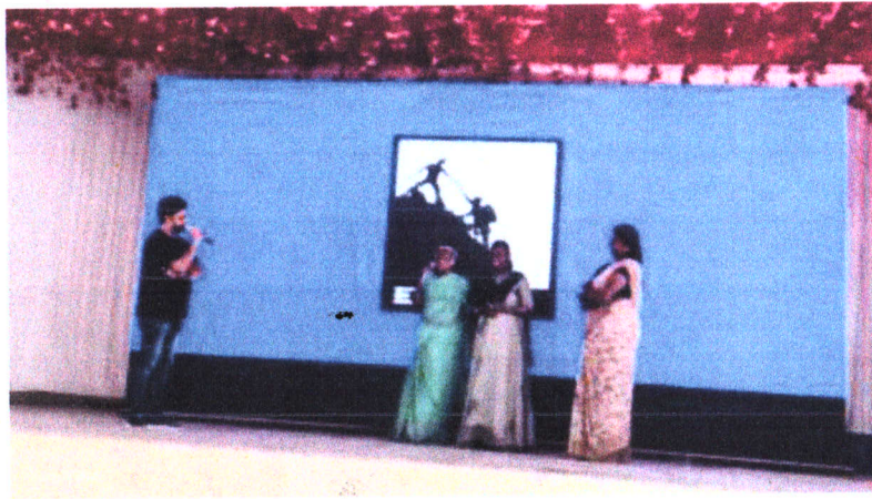
Beneficiaries of Team Everest expressing their Gratitude